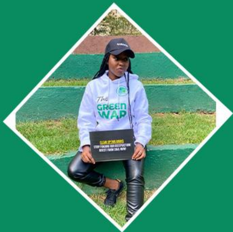
7. Campus lady of the year 2020