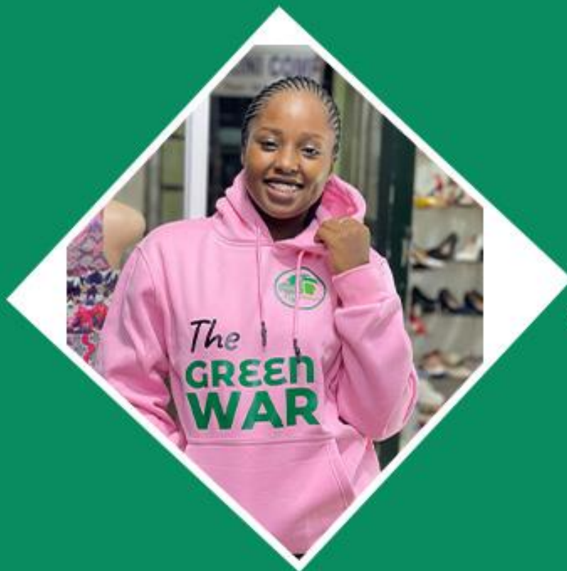
8. 2018/19 Hosted jijue show (Kass TV)