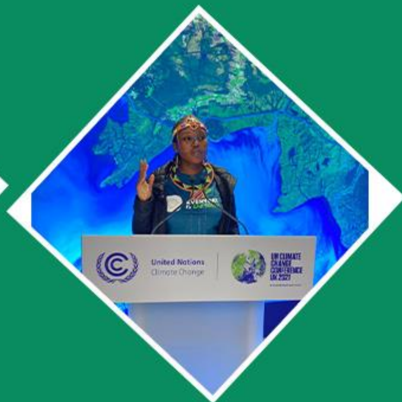
9. Youth Observer COP 26 United Kingdom